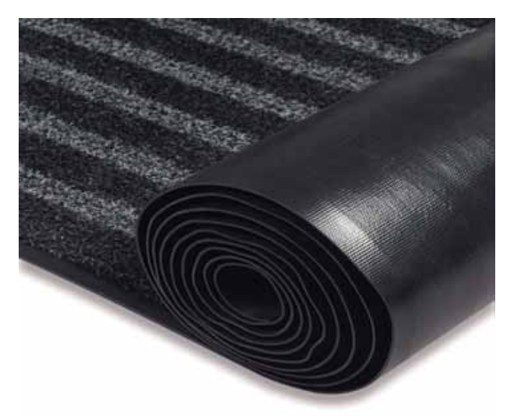
Cero Plus rolls are manufactured on a PVC backing with borders on the long sides. Colour available: dark grey.