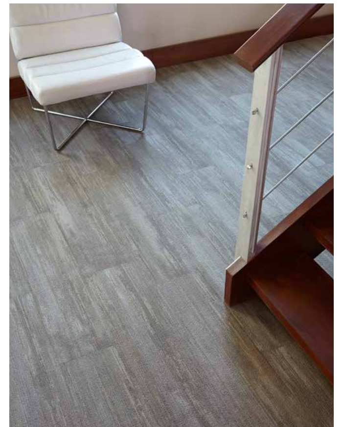
Color Field in Birch Shadow, 25cm x 1m ashlar tile installation