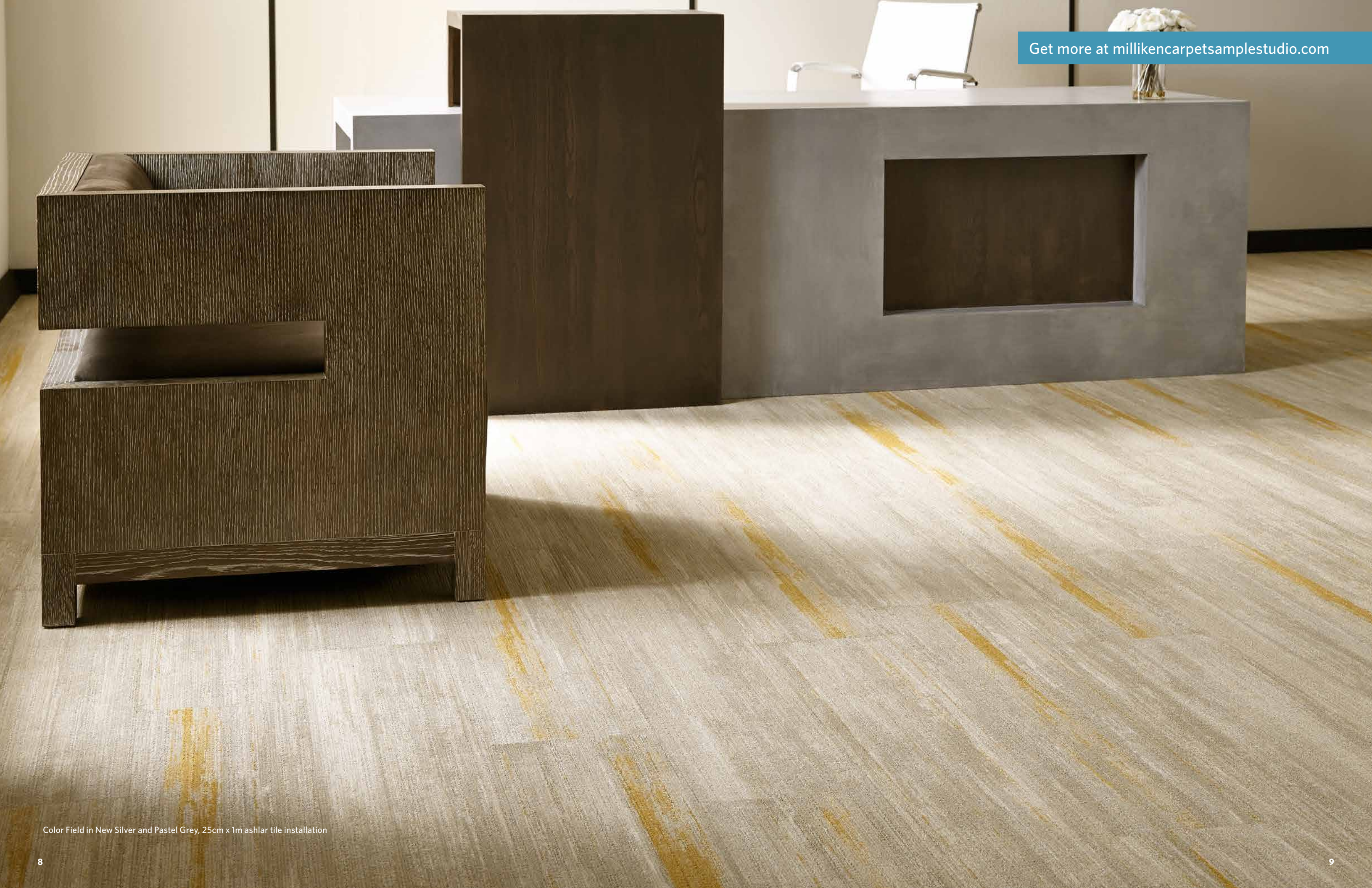
Color Field in New Silver and Pastel Grey, 25cm x 1m ashlar tile installation