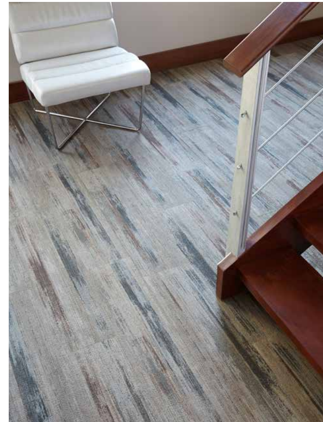
Color Field in Granite Moss, 25cm x 1m ashlar tile installation