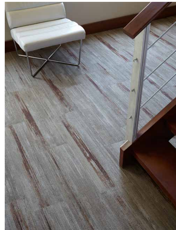
Color Field in Barnwood, 25cm x 1m ashlar tile installation