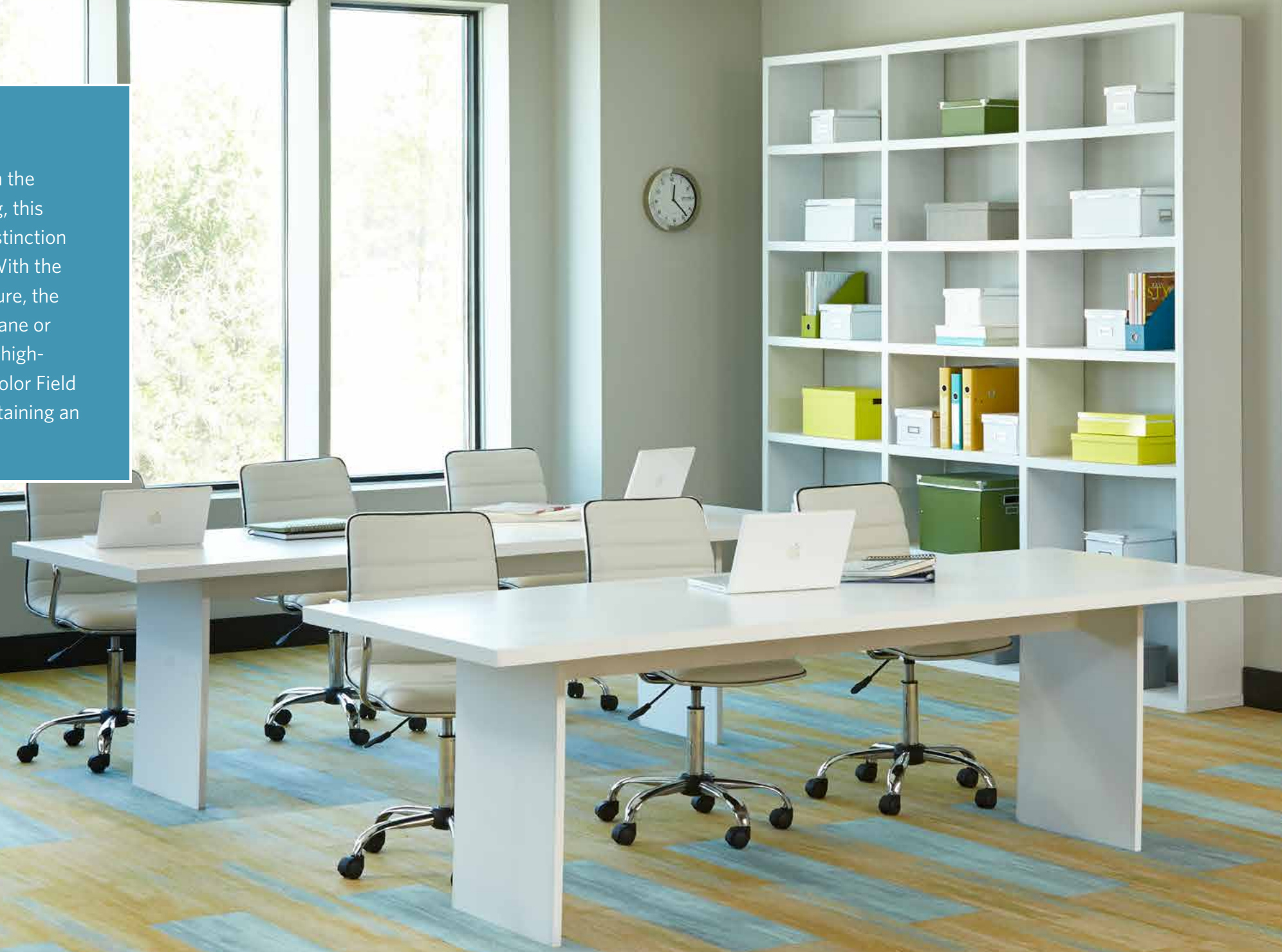
Color Field in Aqua Smoke and Streamside, 25cm x 1m ashlar tile installation

Inspired by the large swaths of color represented in the abstract expressionism style of 'color field' painting, this collection explores the details created when the distinction between subject and background are eliminated. With the ability to discern layers as if they were aged by nature, the collection offers 64 colors to create a quiet floor plane or allow punctuations of color with vibrant hues. This high-performance, severe-rated modular plank allows Color Field to stand-up to the most extreme traffic while maintaining an imaginative color palette.